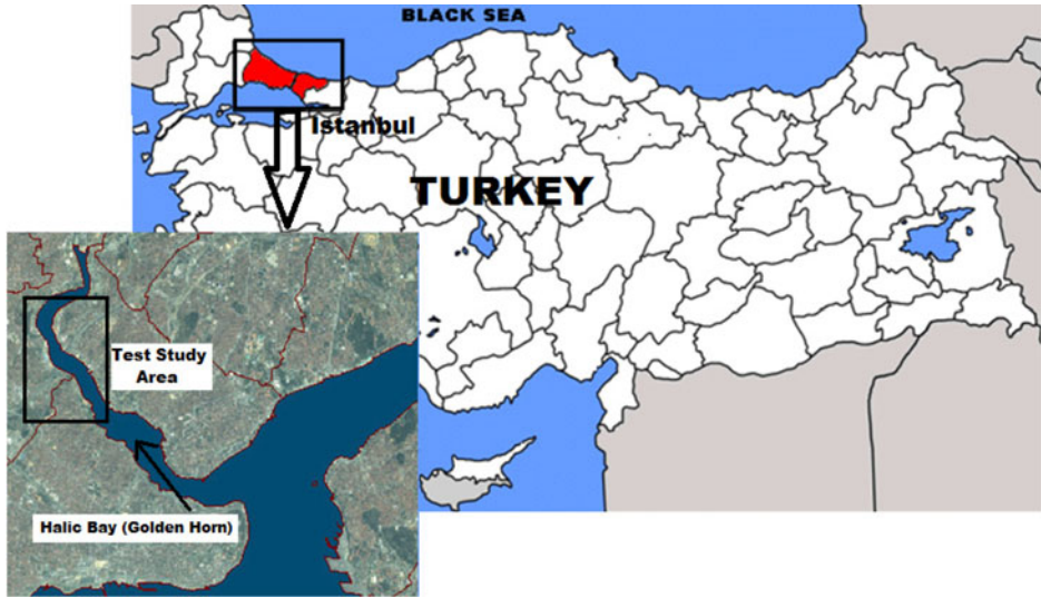
Figure 1. Location of the Test Study Area, Golden Horn, Istanbul.