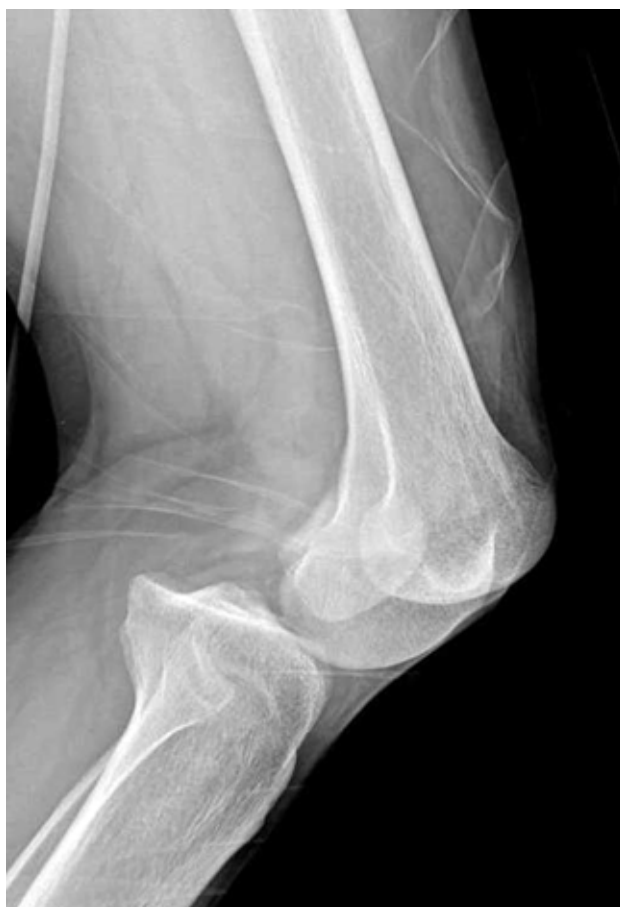
Fig. 1. Lateral radiograph of a patient with ACL/PCL/PLC injuries.

All operations were performed under general anesthesia. The patients were laid supine, and a tourniquet was applied to the involved leg. [9] Diagnostic arthroscopy was performed to assess for any meniscal or cartilage lesions, which were treated as necessary. Remnants of torn ligaments were removed, and notchplasty was performed to eliminate possible graft impingement and to create adequate space for ligament reconstruction. The tendon