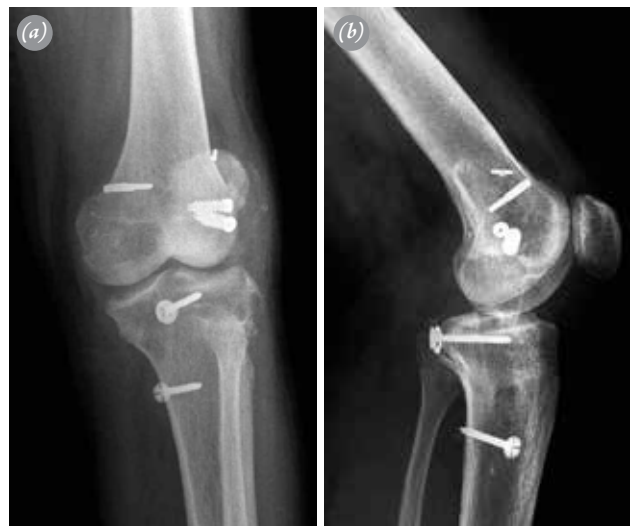
Fig. 2. (a) Anteroposterior, (b) Lateral radiographs demonstrating ACL/PCL/PLC reconstruction (postoperative).

All involved extremities were immobilized at full extension in long leg casts for 4 weeks. Straight leg raising exercises were started on the first postoperative day, and partial weight-bearing was allowed. The casts were removed, and progressive range of motion (ROM) exercises were begun. Full weight-bearing was allowed at the third postoperative month. In order to protect the reconstructed PCL, hamstring exercises were not allowed, nor were patients allowed to perform sports activities before the twelfth postoperative month. Two patients with