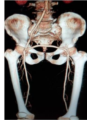
Figure.2. Postoperative CTA image

patency in the femoro-femoral vascular graft (Figure 2). Informed consent was obtained from the patient.