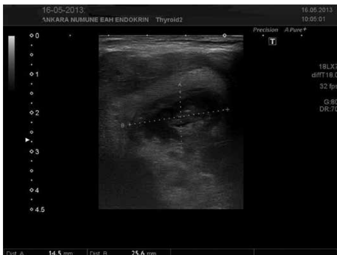
Figure 1. The ultrasonographic appearance of the heterogeneous hypoechoic lesion in the left lobe

Approximately 5 cc of purulent yellow-brown foul-smelling fluid was obtained at the first USG-guided aspiration, the portion of which was cultivated. The patient was administered sulbactam/ampicillin for initial therapy. USG-guided aspirations had to be repeated three more times. Thyroid aspirate cultures showed Peptostreptococcus growth which was sensitive to sulbactam/ampicillin. Two weeks later, thyroid USG showed that the abscess shrank to 2.2x3.1x4.2 mm. On the 20 th day of antimicrobial therapy, all clinical and laboratory signs and symptoms of infection were resolved and antibiotic therapy was discontinued.